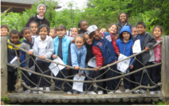
The 1st grade at the New York Botanical Garden