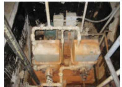
This critical component to the heating system must be replaced

With these funds, we will expand our library's biography and fiction sections. The school will purchase books exploring racial, cultural, socio-economic, and geographical diversity. We will also subscribe to class sets of news media publications.