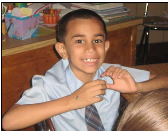
Students sing Tarañitita (The Itsy Bitsy Spider) in Spanish class