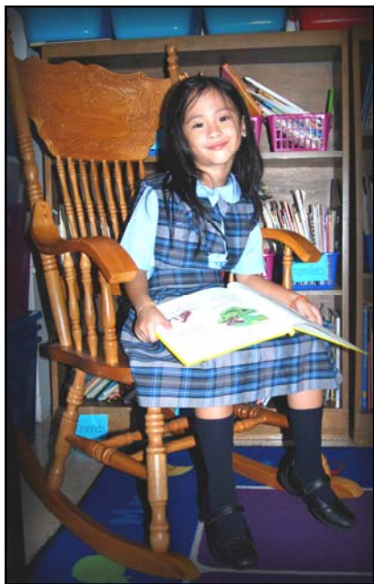
Students enjoy newly purchased library books.

Santa Maria School received $3,000 from the Laura Bush Foundation to purchase Math and Science related texts and magazine subscriptions for the library. Thanks to this grant Santa Maria added over 300 fiction and non-fiction books to its collection and continued to diversify the library's collection.