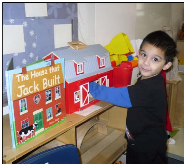
Students learn through play and discovery in the Pre-K program

Collaboration between teachers and administrators has enabled the students in PreK through 1 st grade to receive streamlined instruction. This consistency in programs helps students flourish and develop early