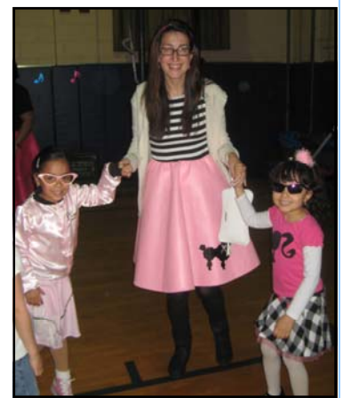
Pictured Above: Students and teachers danced in costume at the '50s Sock Hop to celebrate the decade SMS opened.