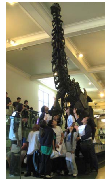
Students and chaperones gaze at a dinosaur fossil

For Santa Maria students, what's even more exciting than a field trip? A field trip chaperoned by Nickelodeon, MTV, and VH1 employees! On April 30 th , 25 Viacom employees accompanied the 4 th grade to the American Museum of Natural History on the Upper West Side.