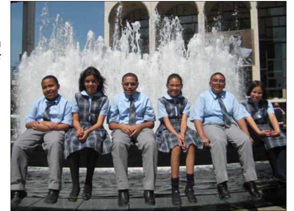
Santa Maria students seated around the fountain at Lincoln Center