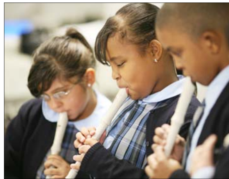
3rd graders playing the recorder